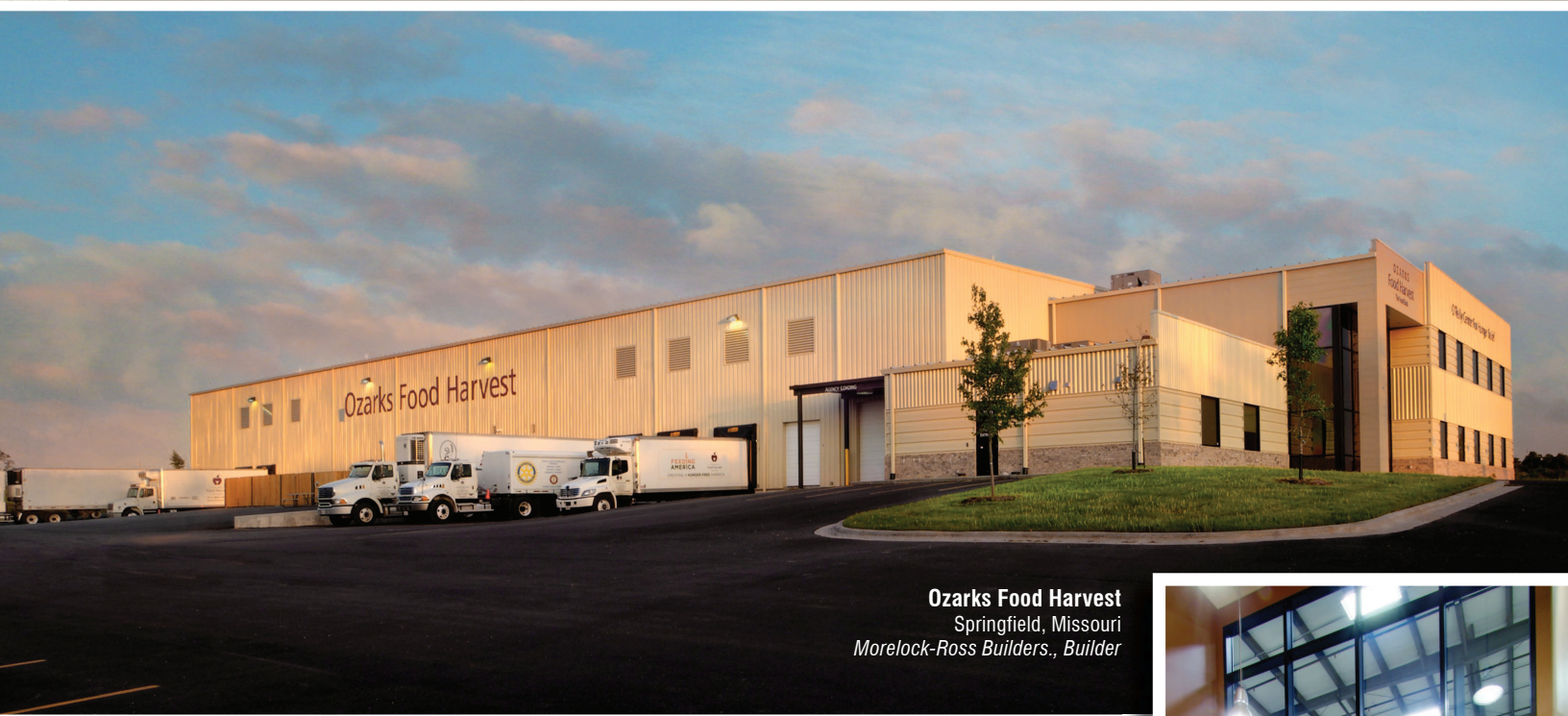
Ozarks Food Harvest Springfield, Missouri Morelock-Ross Builders., Builder

combine common sensibility with uncommonly beautiful designs!