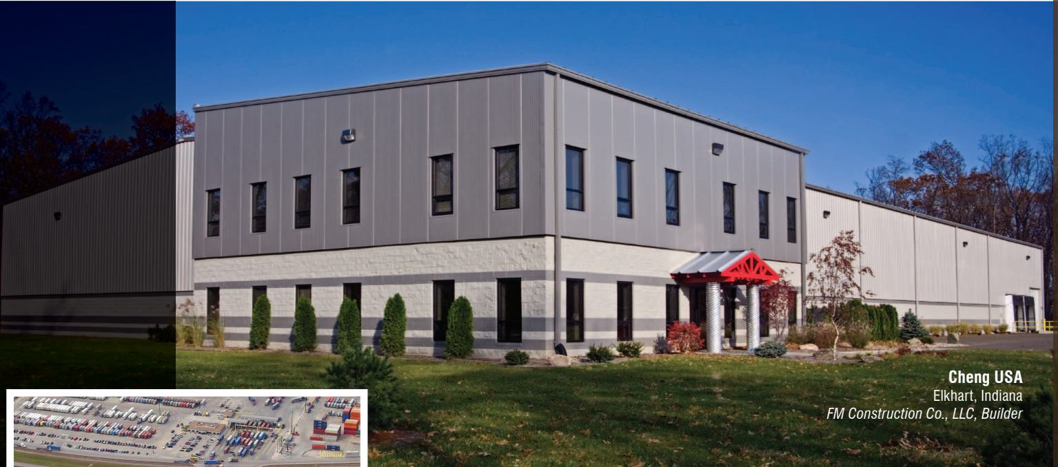
Cheng USA Elkhart, Indiana FM Construction Co., LLC, Builder